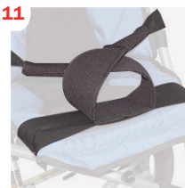
Lateral thigh support-abductor