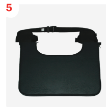
Upper extremity support surface