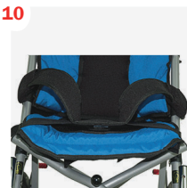
Medial thigh support-abductor