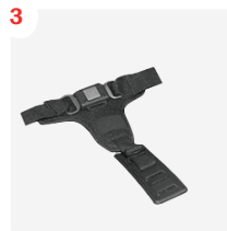
3-pt positioning belt