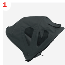
Extended Headrest Cover