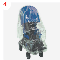
Rain cover and mosquito net