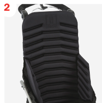
Reducer seat insert