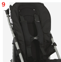
H-harness with padded covers