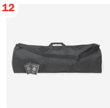
Wheelchair travel bag