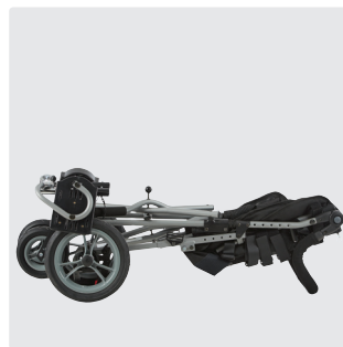
Easy to fold