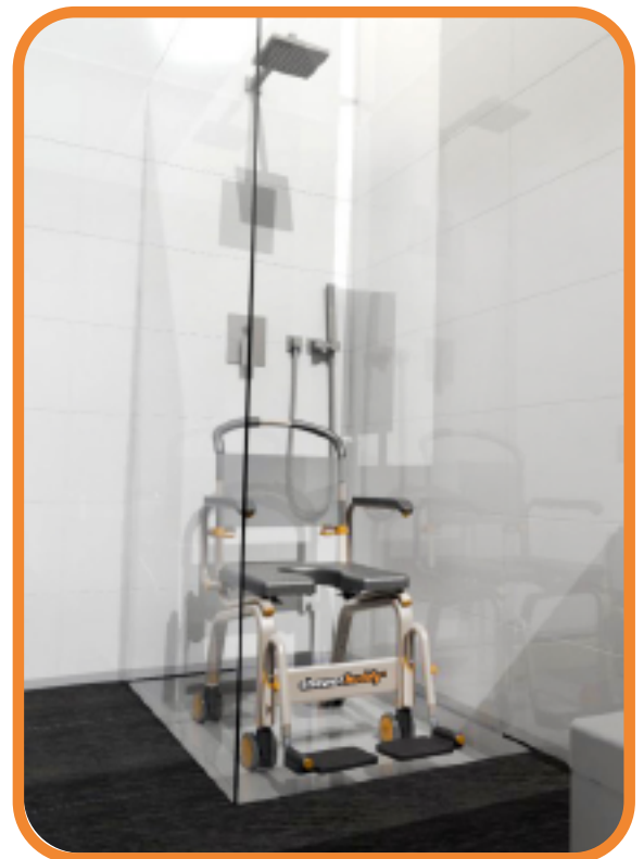
For accessible showers