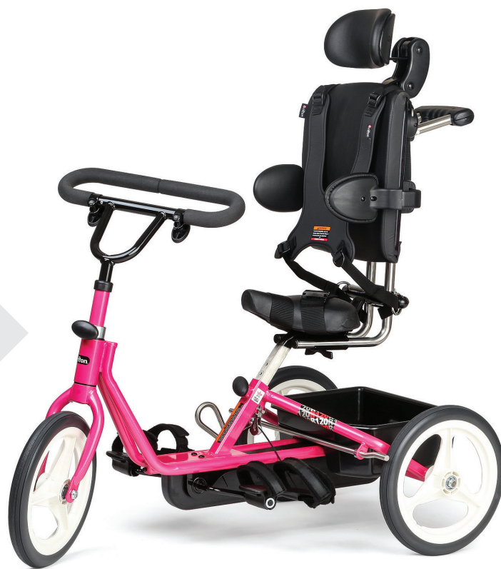
Frame Colour Options

Self-leveling pedals are forward of the seat for comfortable reach and efficient pedaling. Pedal straps come standard on all trikes.