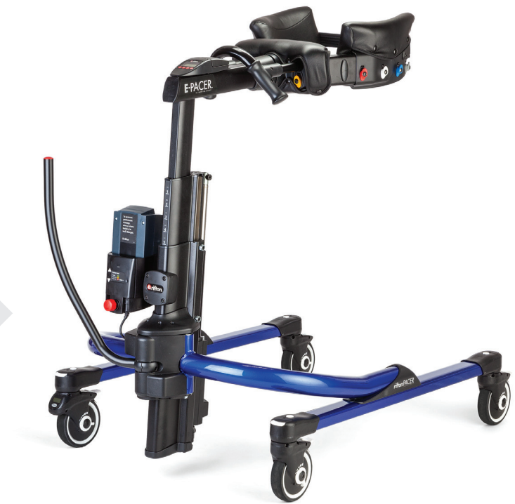
Frame Colour Options

Switch-pole: Lets the caregiver operate the lift without bending down or turn it around to give the client control of the lift.