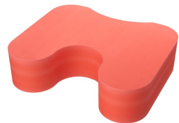
available in two variants with different height; 10 cm/4" or 5 cm/2".

With FootStool as support under the user's feet, it is very easy for the caregiver to place the sliding boards under the user's thighs and seat. When sitting on the sliding boards, one EasyGlide on each side, the pressure from the user's weight is distributed over the soft surface.