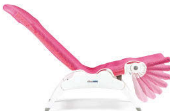
Highly adjustable Backrest angle, seat angle and calf rest angle adjust individually.