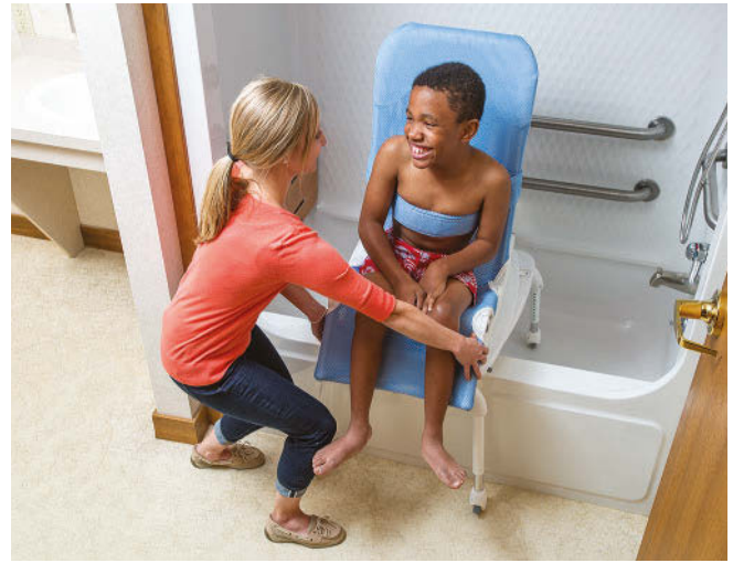
2. Press either of the gray pivot latches and rotate the bath chair and client over the tub.