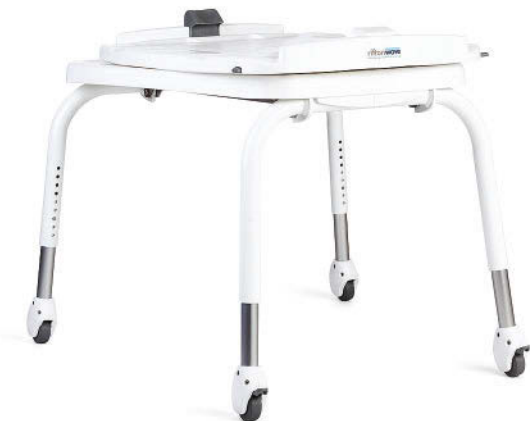
Tub transfer base