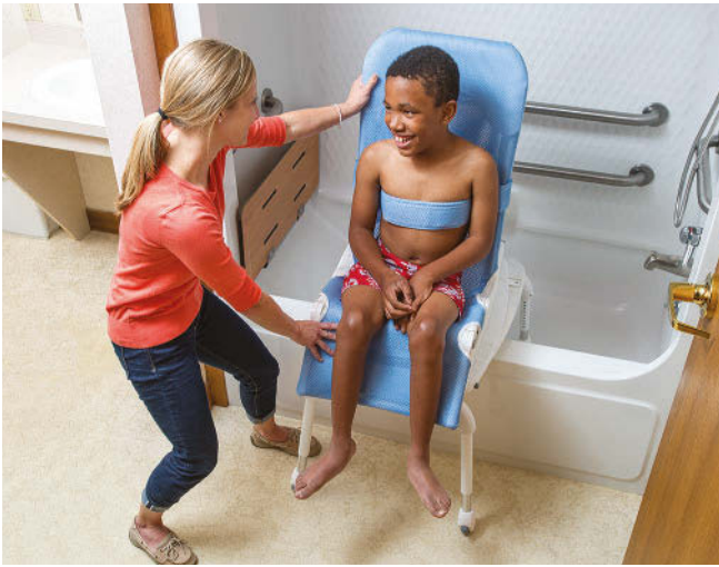
1. With the client secured in the chair, push the transfer base to the back of the tub as far as it will go and lock the wheels.