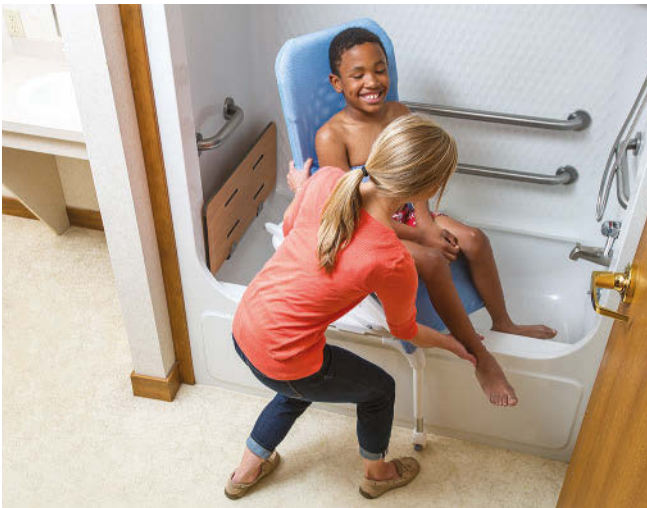
3. As the bath chair rotates, it continues to move back over the tub. Gently lift the client's legs to clear the edge of the tub.