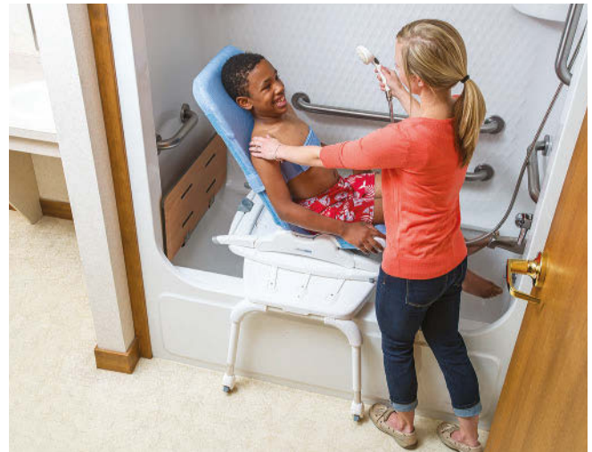
4. In the final position the bath chair is over the tub and can be adjusted as desired for showering.