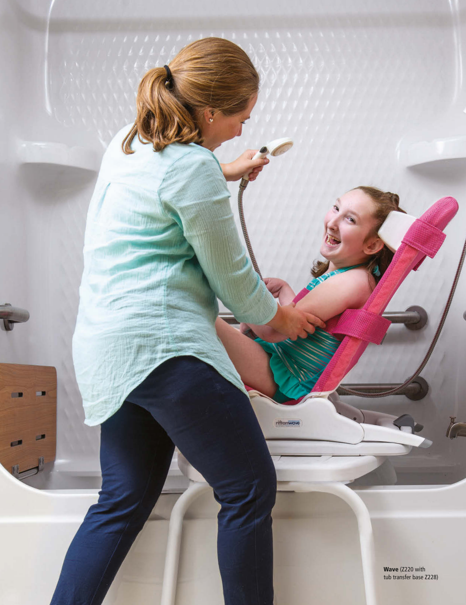
Wave (Z220 with tub transfer base Z228)